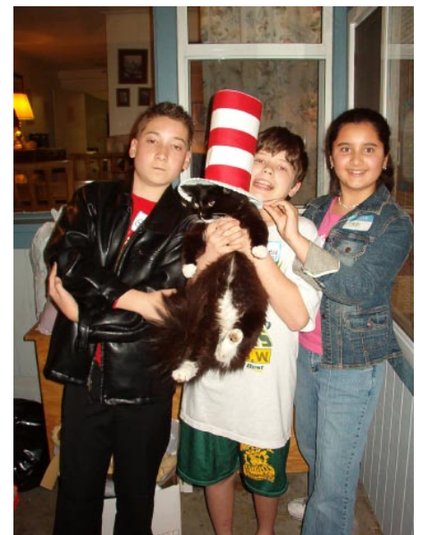
Young readers visit with the cat in the hat at a recent gathering.