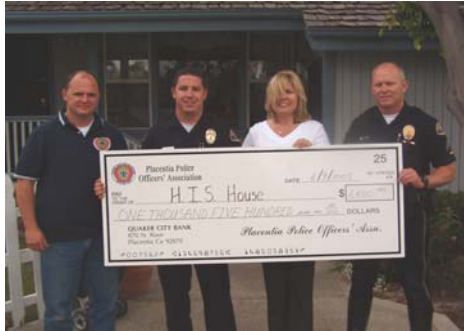
Placentia Police Officers' Association contributes "huge" check.